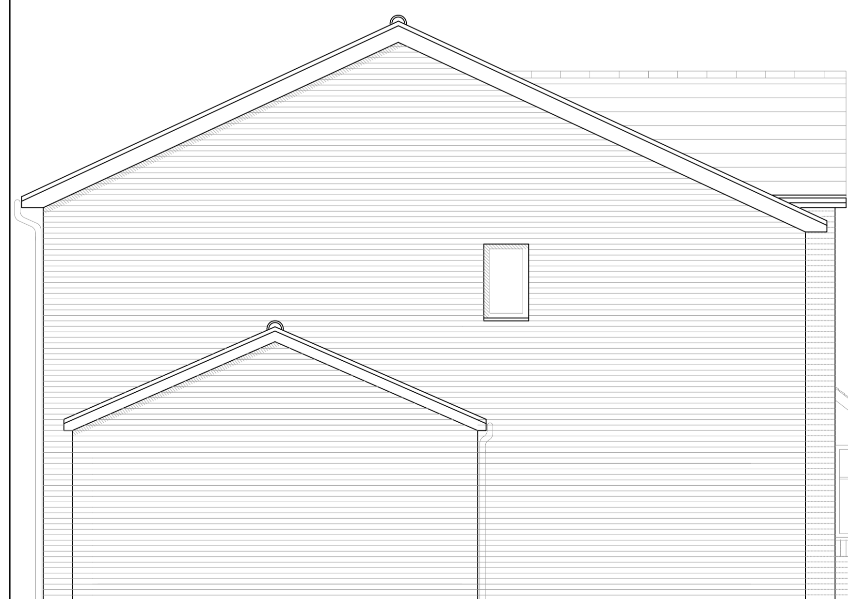
Side Elevation 1