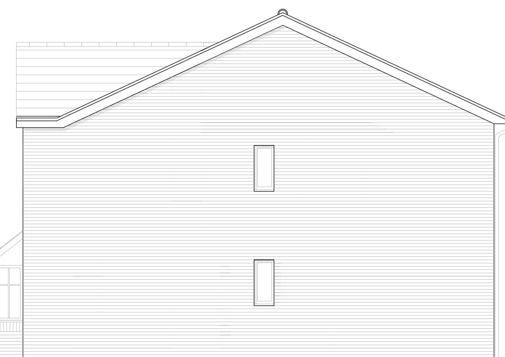
Side Elevation 2