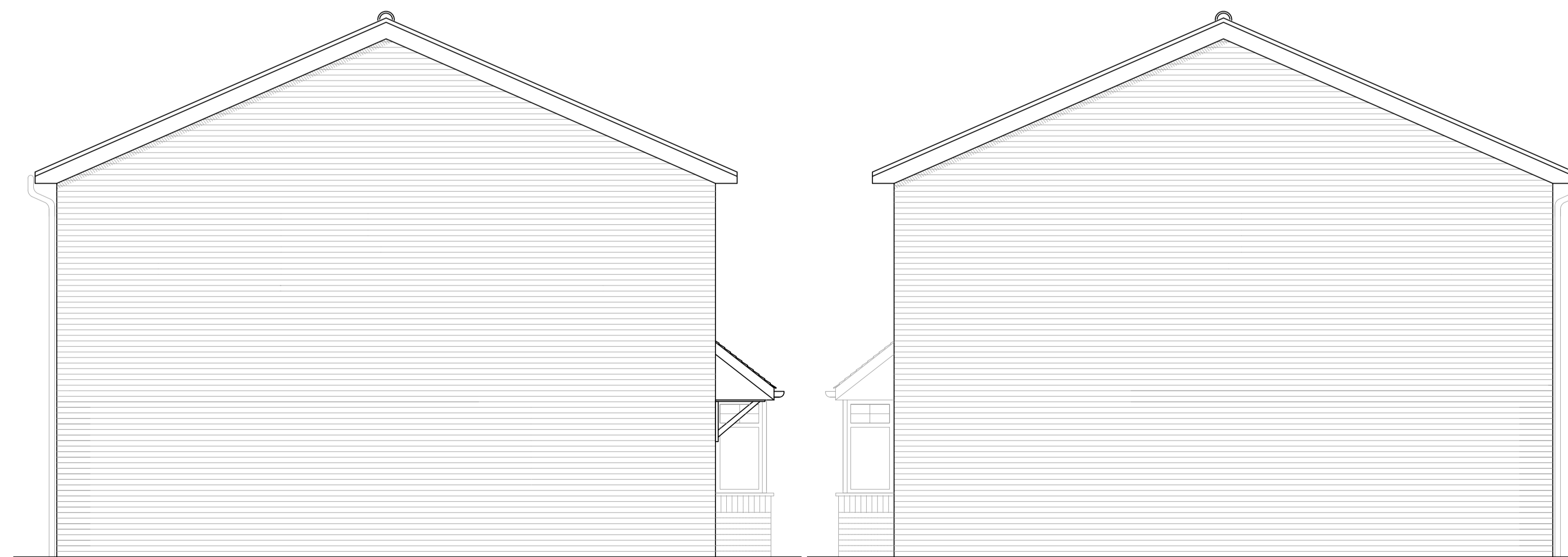
Side Elevation 1